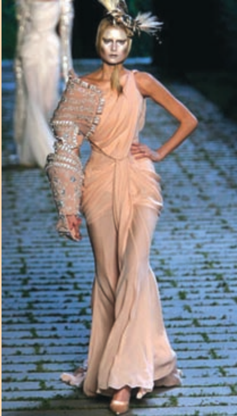
Christian Dior by John Galliano